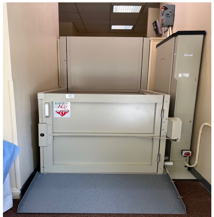
Glyndon UMC's Lift-up Weightlift